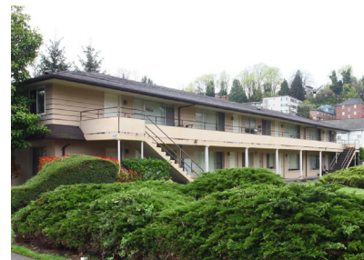
VILLAGE GREEN SEATTLE, WA $7,070,000 | 163 Units