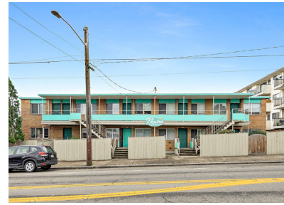
NEUTRA SEATTLE, WA $ 3,625,000 | 12 Units