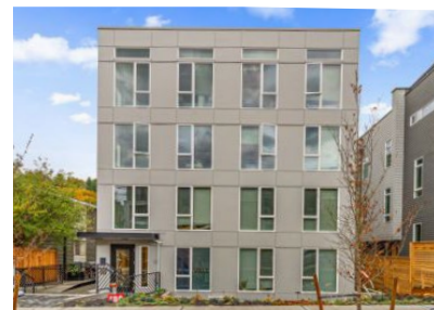
VALE SEATTLE, WA $9,950,000 | 40 Units

Building the lives we want through real estate.